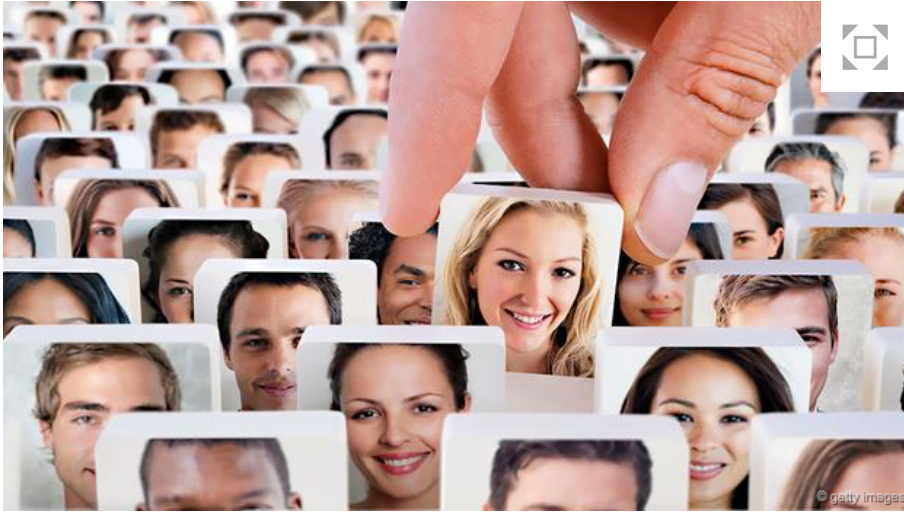
Users of online dating sites are a target for scammers

Intelligence and experience offers no protection against scammers, says Modic. “If it did, then better educated people and older people would be less likely to fall for scams. And that is not supported by my research.”