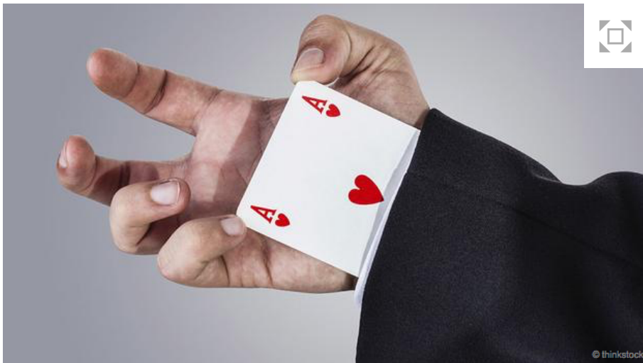
The techniques used by card trick conmen are similar to scammers online